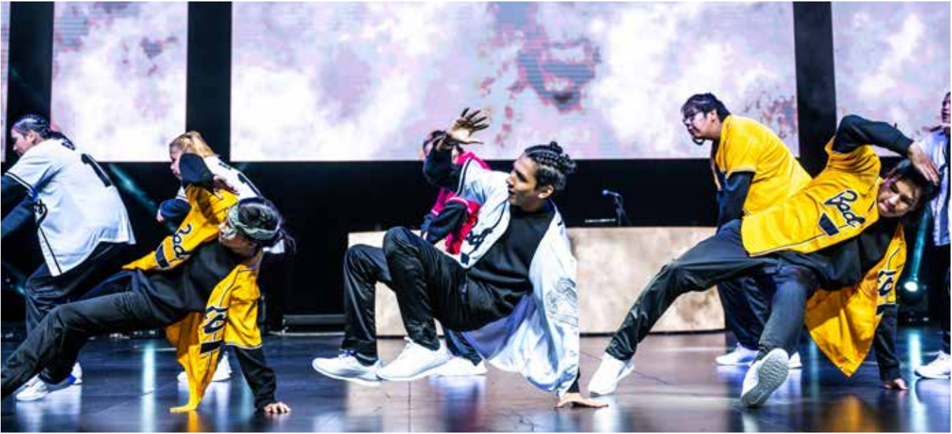
Above: RBC Future Leaders on stage at Meridian Hall.